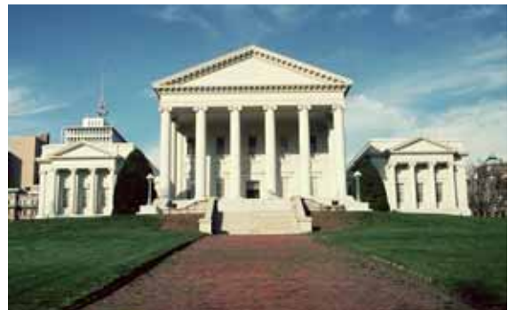
Designed by Thomas Jefferson, the Virginia Capitol stands on a hill up the street from the Omni Richmond Hotel.