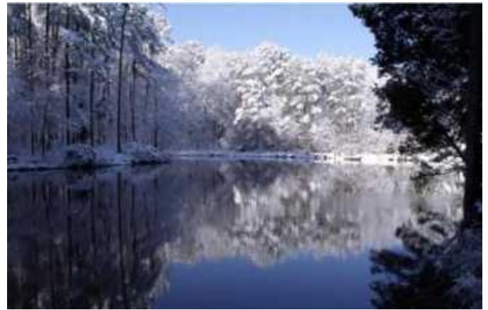
Richmond, Virginia, February 7, 2010

Workshop Registration, Membership Renewal and Conference Registration is available on line at www.aefa.cc . If you have logged in previously and changed your user name and password, you will use that to log in. If you have not logged in before, your user name is the email address that AEFA has for you and your password is AEFA. Renewal and registration is easy using your credit card