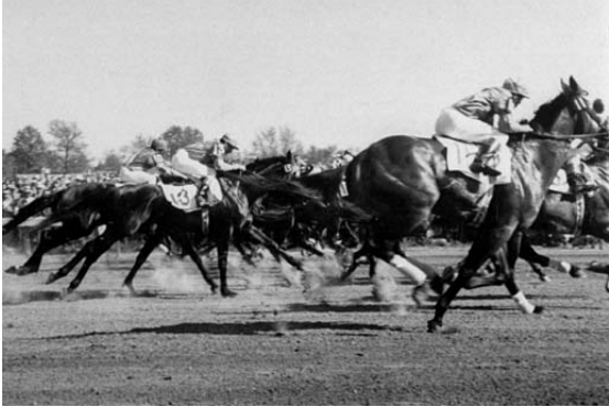
Churchill Downs, Kentucky Derby