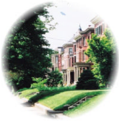
Old Louisville is a National Preservation District, the third largest in the nation, and the largest Victorian district in the United States.