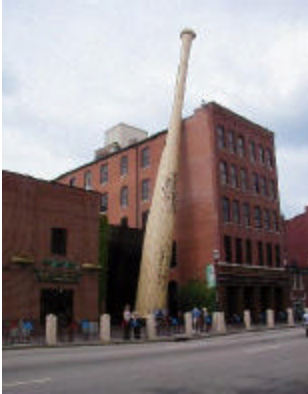
Louisville Slugger Building, which is, yes, in Louisville